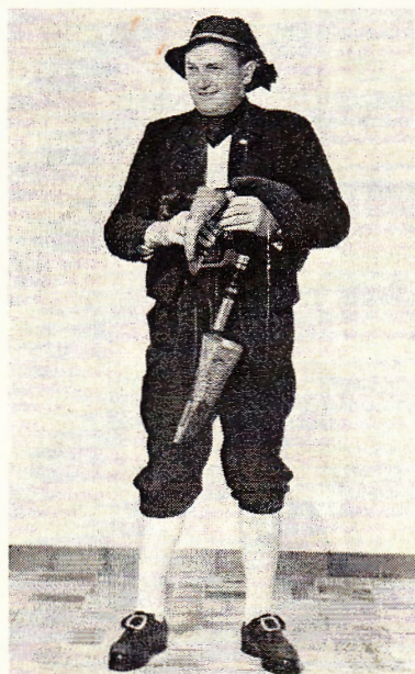
Egerlander Dudelsack Player