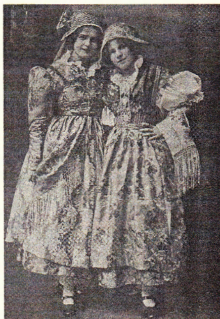
Egerlander Native Tracht