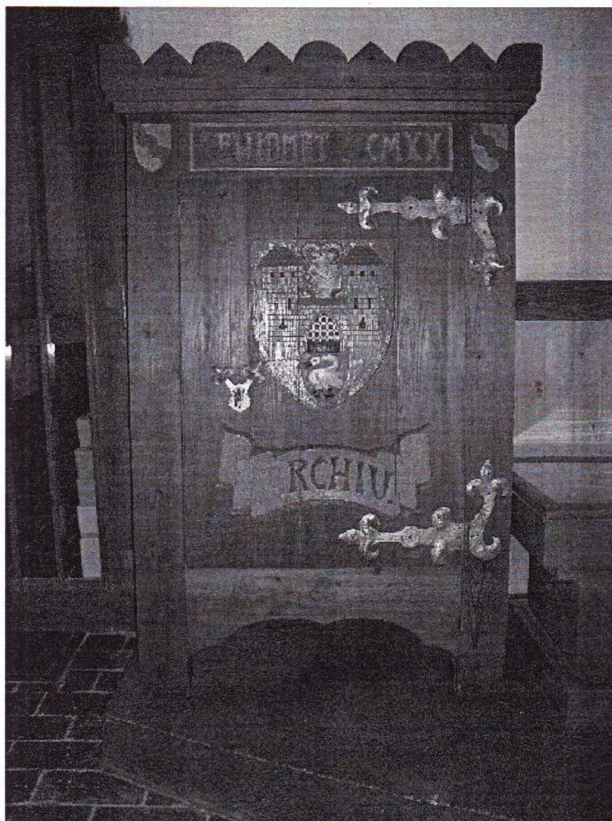
Photo at left: Old cabinet in the State District Archives of Taus in its extension in Bischofteinitz.

It was a component of the Archdeanery of Taus and it administered 14 parishes: Parish offices in Weissensulz and Berg, deanery in Hostau, parish offices in Maclov, in Melnitz, deanery in Muttersdorf, Stockau, Plöß, deanery Ronsperg, parish offices in Waier, Štibor, Schüttarschen, Heiligenkreuz and Eisendorf. The vicars were in charge of the supervision and control activity in the area of the spiritual, official and economic administration of each single parish offices and the deanery itself.